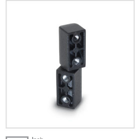
Inch sizes available