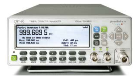
Figure 4: Display showing different statistical parameters viewed at the same time.