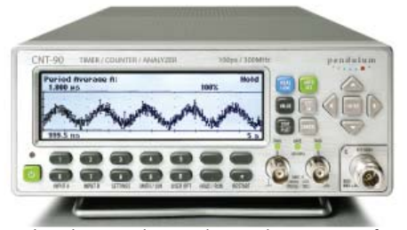
Figure 5: Display showing the trend (signal over time) of sampled data.