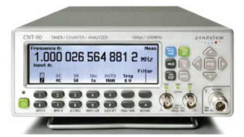
Figure 3: Input parameter setting menu shown with measured result.