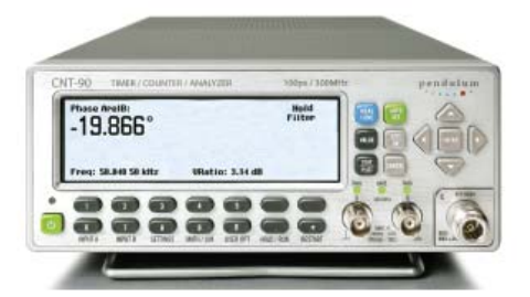
Figure 1: Display showing phase value, frequency, attenuation Va/Vb, and auxiliary parameters.

When adjusting a frequency source to given limits, the graphic display gives fast and accurate visual calibration guidance.