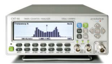
Figure 6: The same result as in Figure 5, now displayed as a histogram.